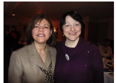
Smiling faces at April meeting.